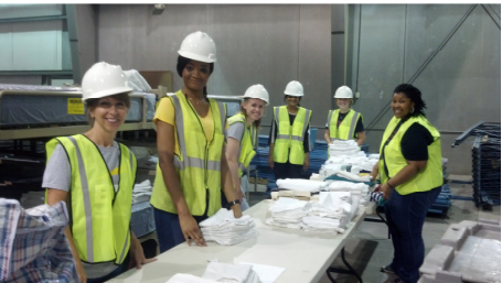
Thanks to Ernst & Young and Safelite AutoGlass for sending these hard-working individuals to help prepare the shelter for its opening.

The YMCA of Central Ohio is staffing and operating the front door and flexible capacity overflow sheltering programs for single adult women. They are also providing overnight staffing for families.