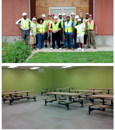
Volunteers from Alvis House built bunk beds and assembled furniture, demonstrating serious teamwork when lifting tables that weigh 450 pounds.

Beginning in mid-November, men who are experiencing homelessness for the first time and those unable to find space in an existing shelter will receive emergency shelter in the Van Buren building. Construction of the new family shelter will begin as soon funds have been raised, with anticipated completion in September 2015. Volunteers of America of Greater Ohio will operate the new family shelter and it will serve 85 families at capacity.