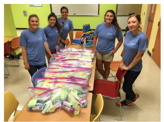
IGS Energy worked in the garden and assembled hygiene kits.