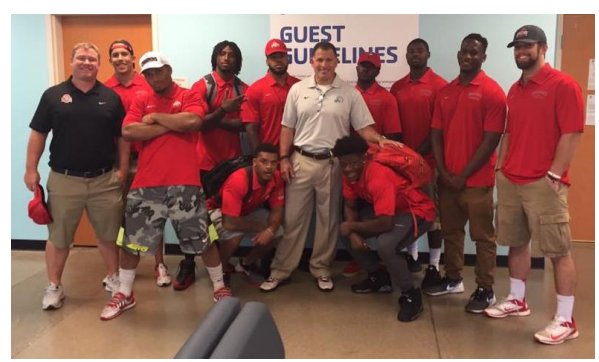
We were thrilled to be joined by football players from the Ohio State University, who served dinner to hundreds of people experiencing homelessness.