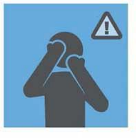
AVOID TOUCHING YOUR EYES, NOSE, OR MOUTH WITH UNWASHED HANDS OR AFTER TOUCHING SURFACES